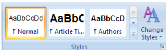
Figure 2. Styles group in Microsoft Word 2007-2013

[Normal] The process of applying styles to text is simple: just position the cursor in the block of text you wish to style and pick an appropriate style name from the list mentioned in the preceding paragraph. In many cases this will not be necessary as this template is programmed in a way that it tries to 'guess' the correct style based on the flow of text.