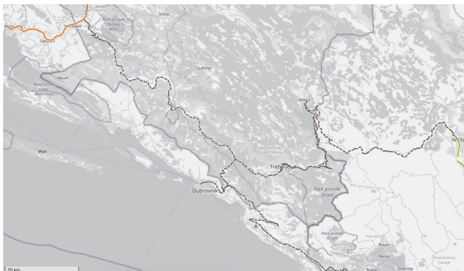
Figure 2 Railway network in the South of Dalmatia [2]