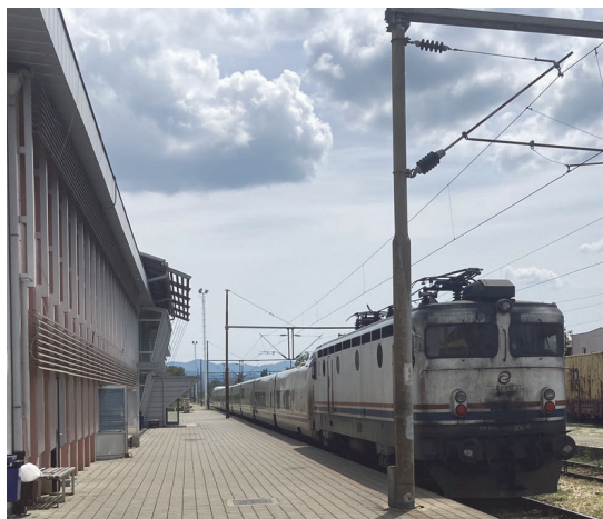
Figure 4 Bosnian Talgo train at border station Čaplina

The domestic night train of HŽPP currently runs only on Fridays to Split and on Sundays back to Zagreb [5]. Additionally, there are several touristic night trains during summer time from Praha, Bratislava, Budapest and Vienna. Besides the ICN, local regional trains between Split and Kaštela Stari try to cover the local traffic demand in the suburban region of Split where there is a populated area along the Adriatic coast. In the south of Dalmatia, Bosnian Talgo trains run cross border during summer time only on Fridays, Saturdays and Sundays while they end on other days in Čaplina which is the border station on the Bosnian side [6].