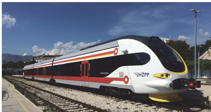
Figure 5 Train set used as so called “Splitski Metro”

In this section so called mid term measures are collected and presented. Due to the high public interest here the opening of additional stops of the existing railway line crossing the city of Split has for sure the highest priority. Several authors have presented their proposals of a railway connection to the Airport of Split which is pretty close to the city of Trogir [8-10]. When looking on the daily press affected people of proposed railway lines are less happy although they will for sure benefit once the railway line is operated. Typically, the construction of a railway line in a tunnel is ten times more expensive than on ground. High costs of construction can cause the end of a project. A way out scenario might be to rethink the Airport connection as a light rail service following the magistrala (street number 8).