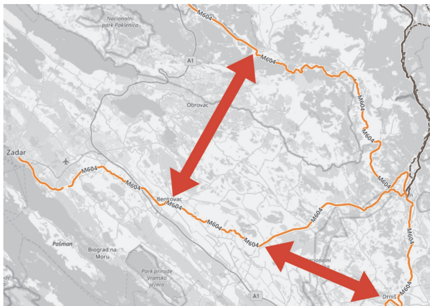
Figure 6 Proposal for new railway lines in North Dalmatia

Once, the mid term solution of light rail services has been realised and the growth of population continues along the coast new lines might be demanded. One gap in the existing network is here the connection from (Zadar -) Benkovac to Gračac or Lovinac which would allow to shorten the travel time by skipping Knin.