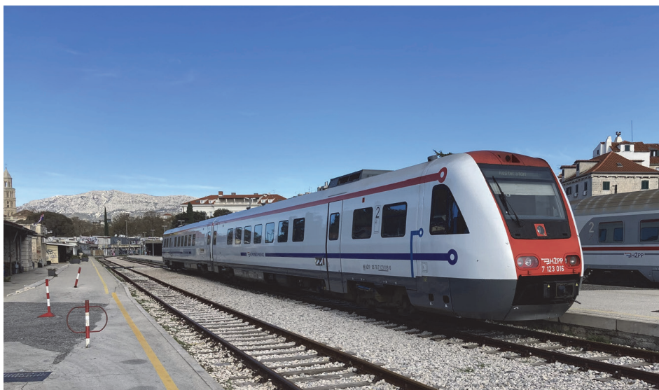
Figure 3 ICN in station Split

Since 2004 so called RegioSwinger from company Bombardier are in use as InterCityNagibni (ICN) between Zagreb and Dalmatia [4]. Stops in Dalmatia are Gračac, Knin, Drniš, Perković (connection to Šibenik), Kaštela and Split. Frequency of service is rather poor: normally one ICN per direction and day, two ICN when more passengers are expected. Running times of scheduled six hours are in comparison to bus services with almost five hours not so bad at all but delays typically occur on the section of the Zagreb-Rijeka-Line where there are a lot of freight trains running as well.