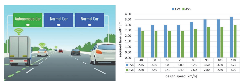
Lane width for AVs: a) separate lane for AVs [12; b) comparison of the lane widths prescribed by [8] and reduced lane widths for AVs [9-10]

Finally, cross-sectional dimensions are expected to change in the future because of the reduction in lane width. By using the Lane-Keeping-System (LKS), which enables AVs to operate continuously in the middle of the lane, the required lane width could be reduced because of reducing safety lateral width used to enable safety buffer between vehicles [11].