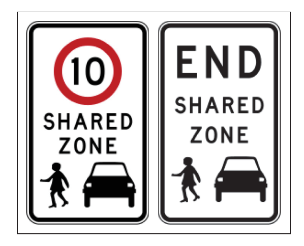
Figure 5 Shared space signs in Australia [10]

Outside the EU, for example, according to Australian Road Rules [10], shared zone exists where there is a shared zone sign and an end shared zone sign on a road and there is no intersection on the length of road between the signs – that length of road. The speed-limit applying to a driver for any length of road in a shared zone is the number of kilometers per hour indicated by the number on the shared zone sign on a road, or the road into the zone. In the shared zone a driver of a vehicle entering or proceeding along or through a shared zone must give way to a pedestrian who is in the shared zone.