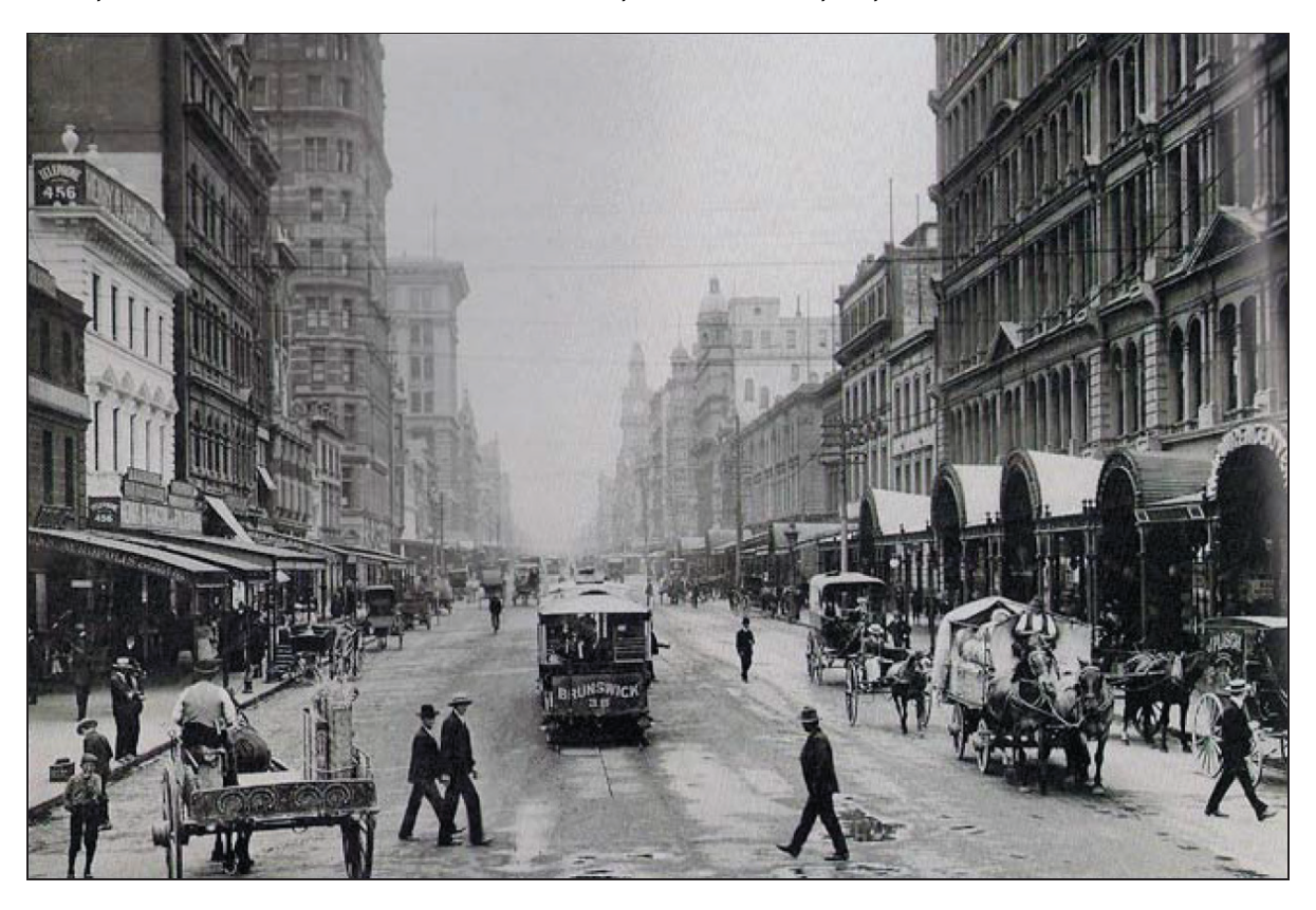
Figure 2 Natural shared space in Elizabeth St, Melbourne c1900 [3]

towns (Makkinga) have virtually eliminated horizontal and vertical signaling, [3]. It could be concluded that the lack of signposts of priority and signaling at intersections does not affect the safety of traffic participants. Monderman and his colleagues embarked on a redesign of increasingly complex intersections with higher traffic burdens, and as a result, they reduced the speed and burden of accidents with a space closer to people.