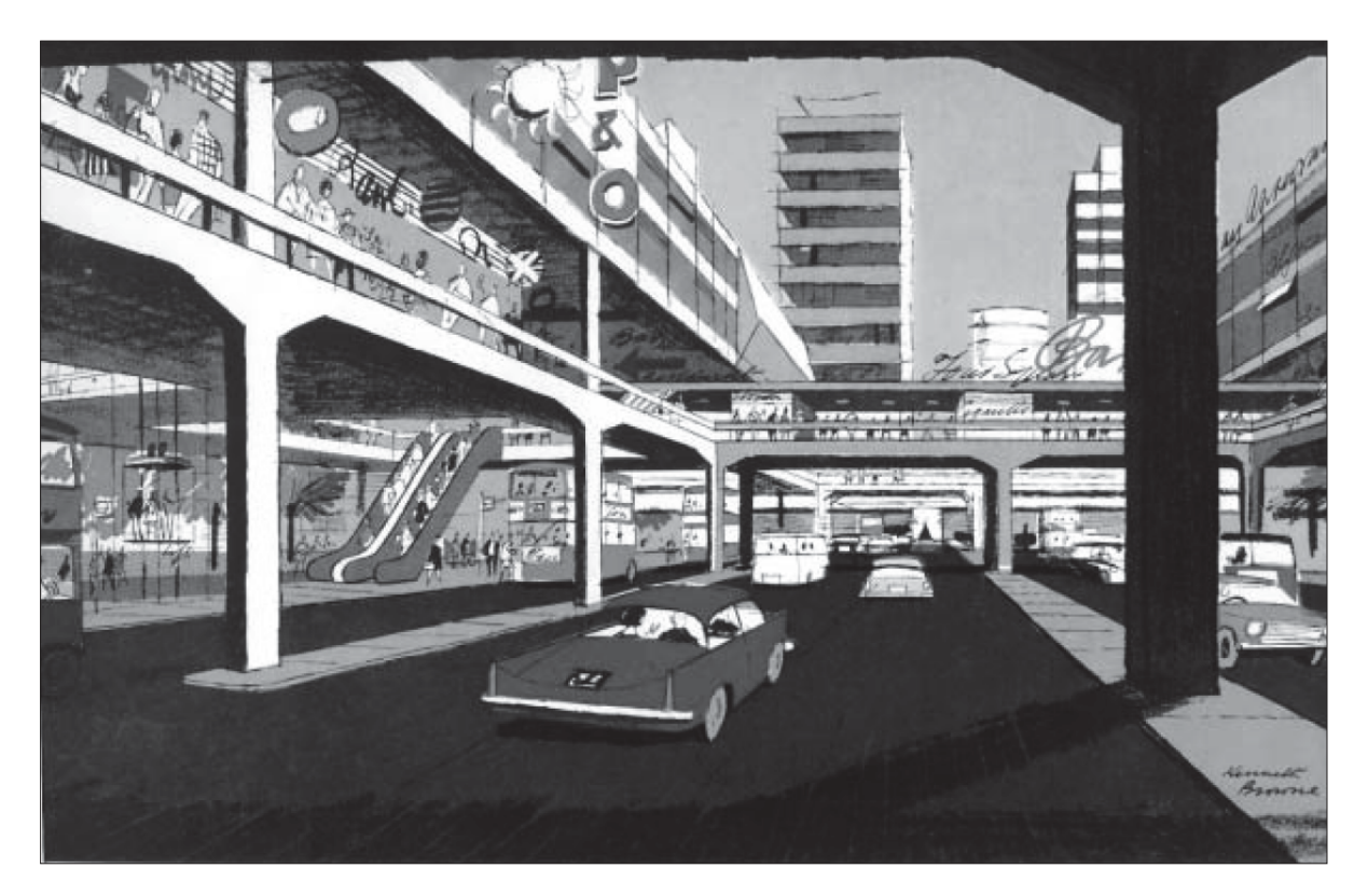
Figure 1 Segregation of traffic from civic spaces, [1]

Within "shared space" concept, space is accessed from the point of view of the community. It is developed according to the philosophy that when designing public space all functions must be in balance. Designing and appearance of public spaces should therefore be made equal to the various functions and meaning of these areas for people. Areas, designed so far by the driver's requirements and traffic politics, are now becoming a space with the fusion of different content.