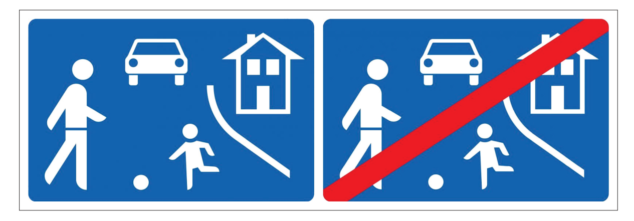
Figure 3 Traffic calming zone signs in Croatia [8]

In the UK, there is a "shared space" sign and it stands for the road ahead where motorists, cyclists and pedestrians should expect to share the same space, [9].