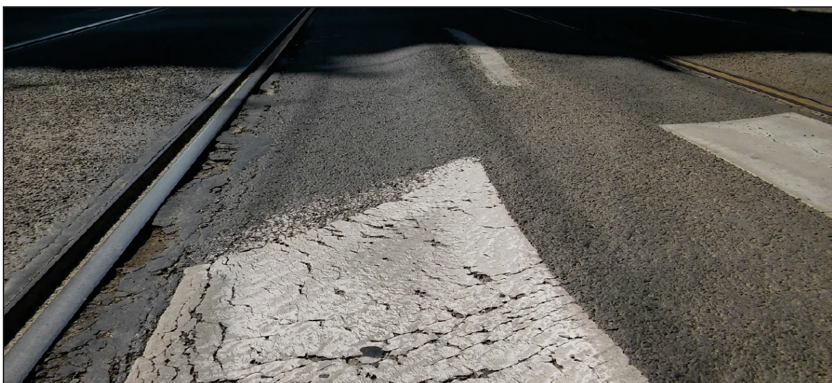
Figure 5 Troughed track and disintegration along the rail (Szeged, Anna-kút junction)