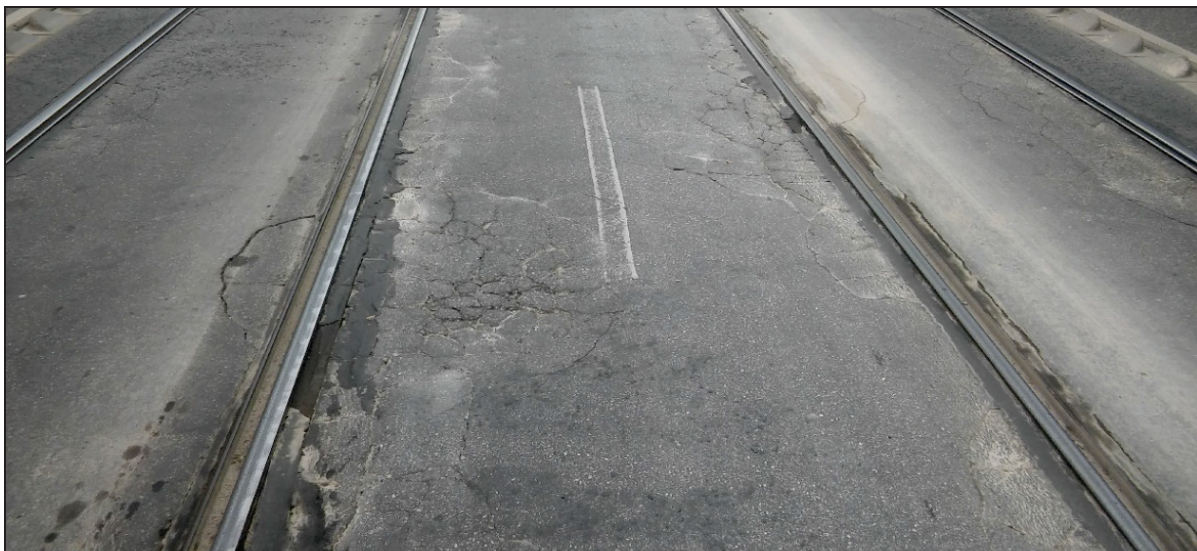
Figure 4 Pavement defects starting from rail pavement connection (Budapest, Múzeum boulevard)