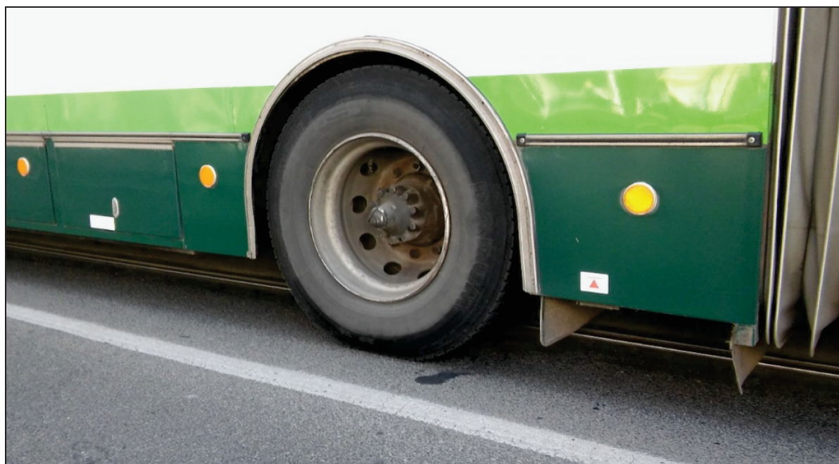
Figure 2 General position taken up by bus tire on rail guided public road

rail outer surface due to the given vehicle wheelbase distance (tires included) and it is also observed that vibration induced by public road vehicles causes the highest load also within this 20-30 cm wide band to certain pavement structures built here (Figure 2).