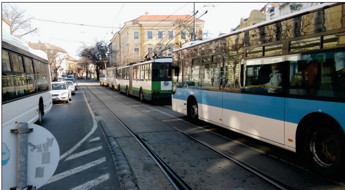
Figure 1 Trams, trolleybus and bus conjunction in Szeged, Dugonics square

se are also beneficial from area usage point of view too, which are really important to manage in cities. Public transport lanes bring a new approach to traffic management when the same pavement surface can be used either by trams, buses or trolleybuses (Figure 1).