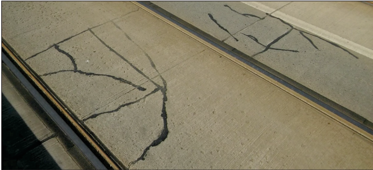
Figure 3 Basalt concrete layer with crack treatment applied (Szeged, Kossuth Lajos boulevard)