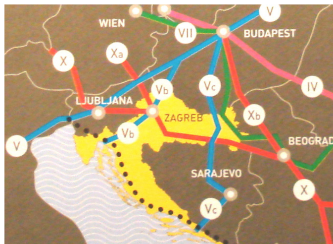
Figure 2 Routes of European traffic corridors passing Croatian territory [1]

Due to its auspicious traffic position to the main European transport routes, Croatia is divided by the pan-European multi-modal corridors: Corridor v (its Vb and Vc routes) and Corridor x (its main and Xa route). Figure 2 shows European traffic routes passing Croatian territory defined in Helsinki in 1997.