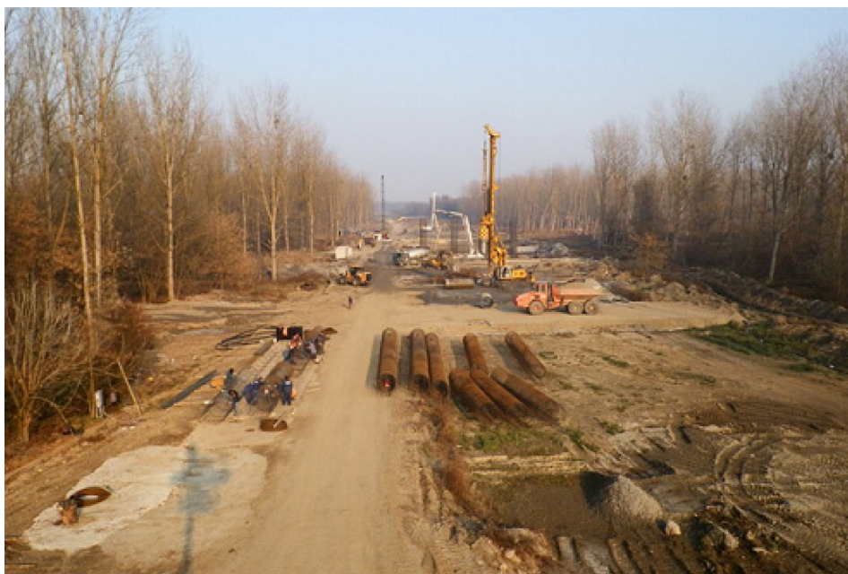
Figure 7 Construction site on the Drava River Bridge