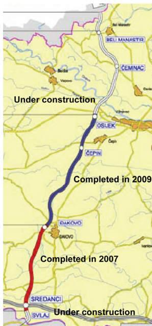
Figure 3 Sections of A5 motorway [3]

First section of route A5, Đakovo–Sredanci was opened to traffic in November 2007 in total length of 23.0 km. The second section, Osijek–Đakovo was opened to traffic in April 2009 in total length of 32.5 km. Building of the Drava Bridge represents construction beginning of longest unfinished section Osijek–Beli Manastir in length of 24.6 km. After complete of that section, the shortest section Beli Manastir–Hungarian border in length of only 5 km is to be built. In September of 2011, works on the section Sredanci–B&H border started and the end of the works is planned in 2013th. This section in total length of only 3 km is one of the most expensive ones because of 6 facilities, including complete construction of Svilaj border crossing which must be constructed according to Schengen conditions and bridge over river Sava which is to be financed jointly by Croatia and B&H [4]. Figure 3 presents motorway A5 divided into sections according to the time of opening to traffic [3].