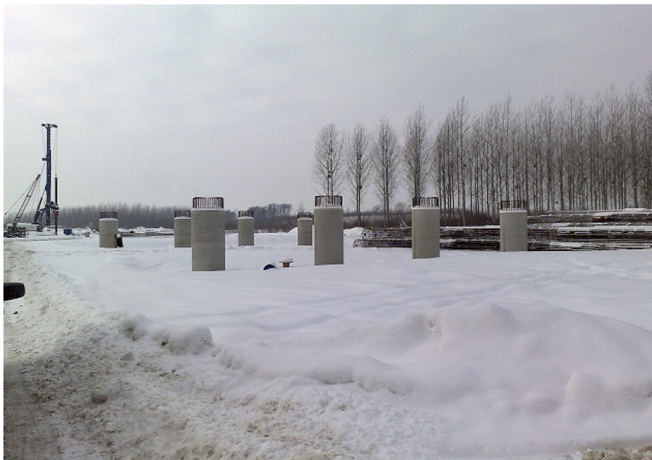
Figure 6 Construction works on the Drava River Bridge