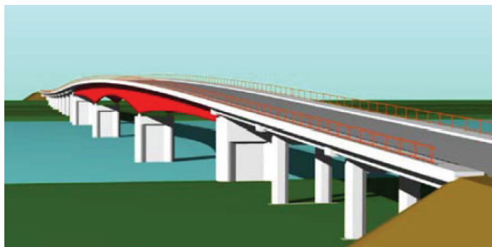
Figure 4 One of the bridge conceptual design solutions [3]

Plan view of the bridge starts with curve radius of 4000 m which continues into the transition curve length of L=200 m ( A=894.43 m), straight line length of 1055.68 m, another transition curve with length of L=200 m and it ends with curve of 4500 m radius [6]. Bridges vertical alignment is conditioned by navigation clearance so it is designed with vertical convex curve, tangents grade of 0.61%.